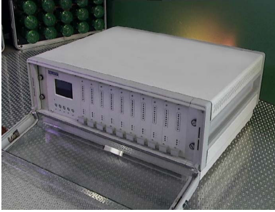
LM8000D Cold Cathode 80 Channel Dimming programmable controller.