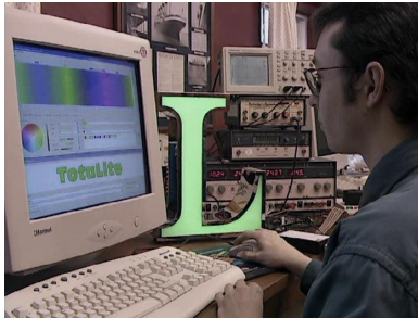
Colour sequences (above) with 'ColourMaster' Configuration Tools. Configuring LM8000D (below) with LightMaster Configuration Tools.