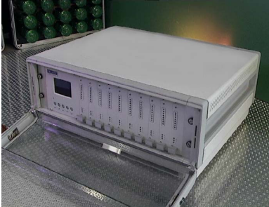
LM8000D Neon 80 Channel Dimming programmable controller.