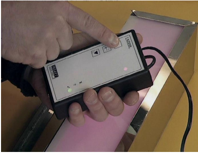
LM300L Colour changing programmable RGB LED Controller.