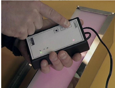
LM300L Colour changing programmable RGB LED Controller.